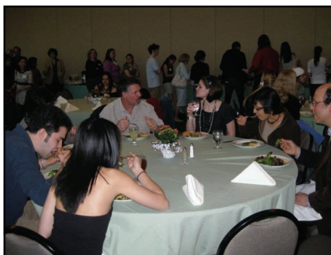
Honors students, faculty and staff attended the annual Honors Banquet.