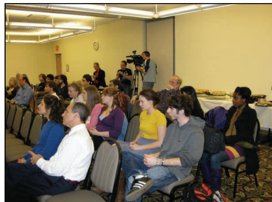
Many students, faculty and staff gathered to hear Honors students discuss their thesis research during Honors Week, April 20-24, 2009.