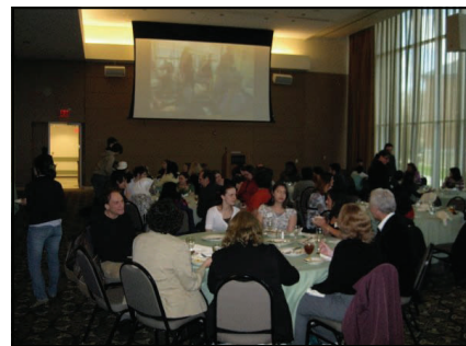
The annual Honors banquet is held each year at the conclusion of Honors Week at William Paterson.